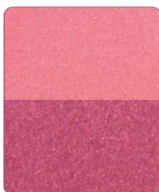
Tonos™ Flash Russet T-1660S Size(μm) 9 - 45