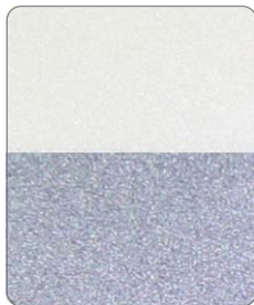
Tonos™ Soft White T-1900K Size(μm) 5 - 35