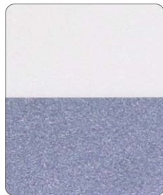
Tonos™ Dazzling Standard T-1900S Size(μm) 9 - 45