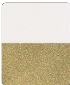
Tonos™ Dazzling Gold T-1701S Size(μm) 9 - 45