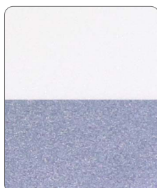
Tonos Dazzling Standard T-1900S Size( \mu\text{m} )9-45