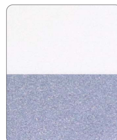
Tonos Snow White T-1800S Size( \mu\text{m} )9-45