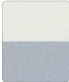
Tonos™ Rutile Fine White T-1901D Size(μm) 5 - 25