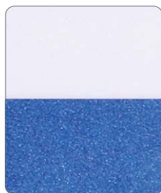
Tonos™ Dazzling Blue T-1781S Size(μm) 9 - 45